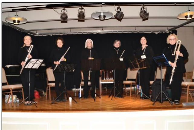
Sounds of Silver treated us to musical notes of the flute.