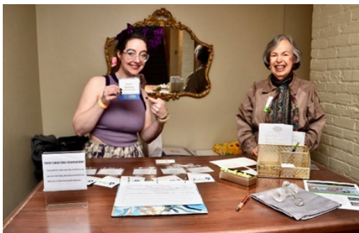
Table Reservations: To reserve a noon luncheon table with your guest, reservations must be made in person on Monday morning at the Arrangements Table on the first floor.

Prospective members and guests must register at the Membership Table in the lower level. Guests will receive name tags and be recognized during the meeting.