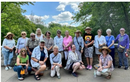
JULY 2023 OUT AND ABOUT WITH AAUW AT MINNEHAHA FALLS